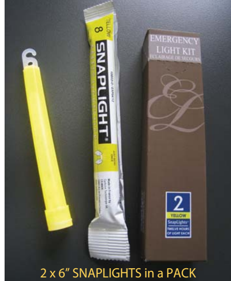
2 x 6" SNAPLIGHTS in a PACK

Hotels Image Brand Communication A Security "Plus" Service